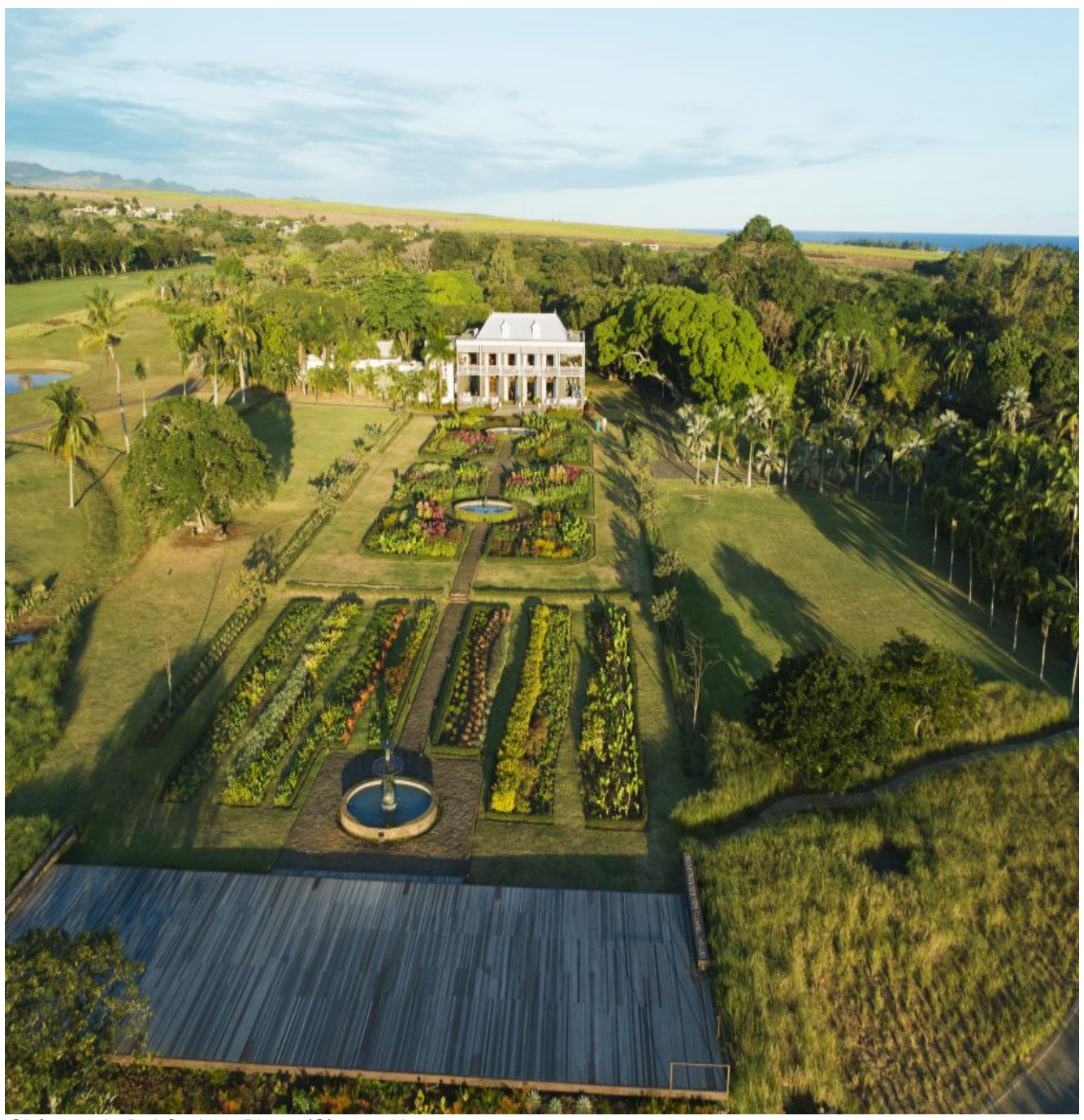
Château de Bel Ombre.

Nestled within the warm embrace of the Indian Ocean, Mauritius boasts a seafood tradition celebrated by discerning diners. Among the island's culinary gems lies a handful of longstanding establishments in the village of Grand Bay. Here, indulge in a symphony of flavours including baked crab gratin with heart of palm, crispy zaatar marinated tiger prawns in lobster bisque cream, lobster ravioli, and braised Babonne fish fillet, each showcasing the ocean's bounty.