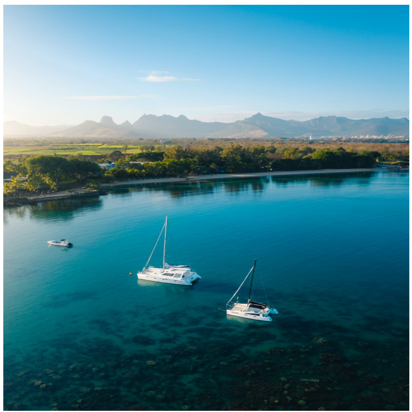
Private catamaran cruise.

A private catamaran voyage stands out as the ultimate coastal exploration. Relax in a hammock above sparkling waters as you skim across the ocean, taking in the view of lush islands and powdery beaches. Drop anchor at secluded spots for swimming and snorkelling, then return to indulge in a tropical feast of crisp salads and succulent fruits. For those seeking leisurely excitement, join a private luxury catamaran for thrilling deep-sea fishing not too far from the beaches of Pereybere and Grand Baie. Alternatively, embark on a dolphin cruise for an exhilarating encounter as these playful creatures dance alongside your vessel.