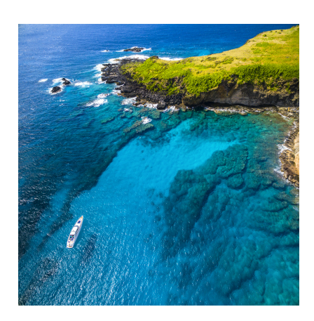
Why Mauritius Should Be Your Next Luxury Getaway