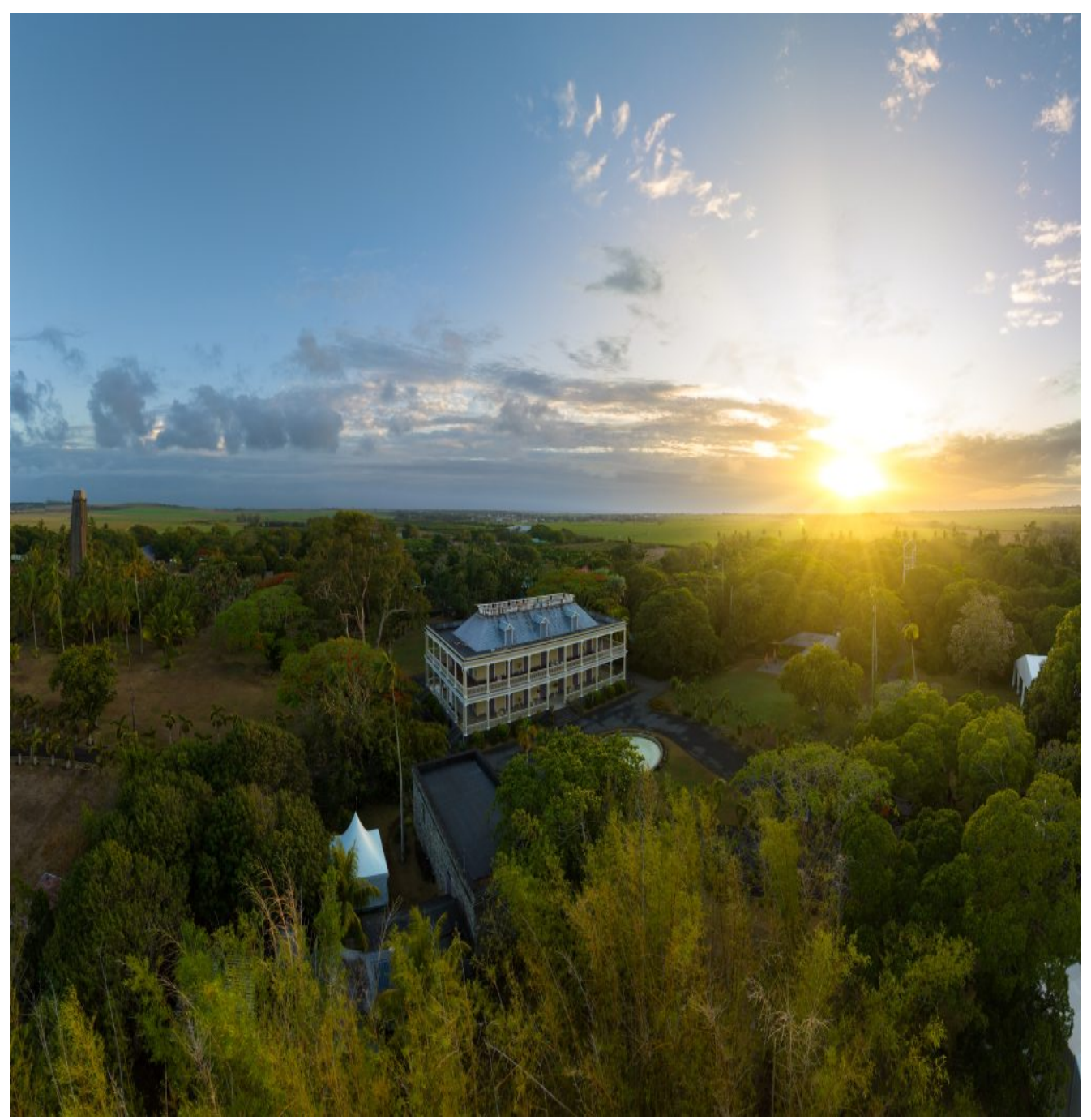
Château de Labourdonnais.

Resorts abound with verdant landscapes and breathtaking vistas at every corner, including secluded beaches reminiscent of the idyllic lle aux Cerfs. Perfectly manicured gardens with tropical flowers flourish between rows of multi-storey retreats, and ritzy chalet-style villas face the sea. The sound of the waves lapping against the shore keeps one company, audible even from a distance.