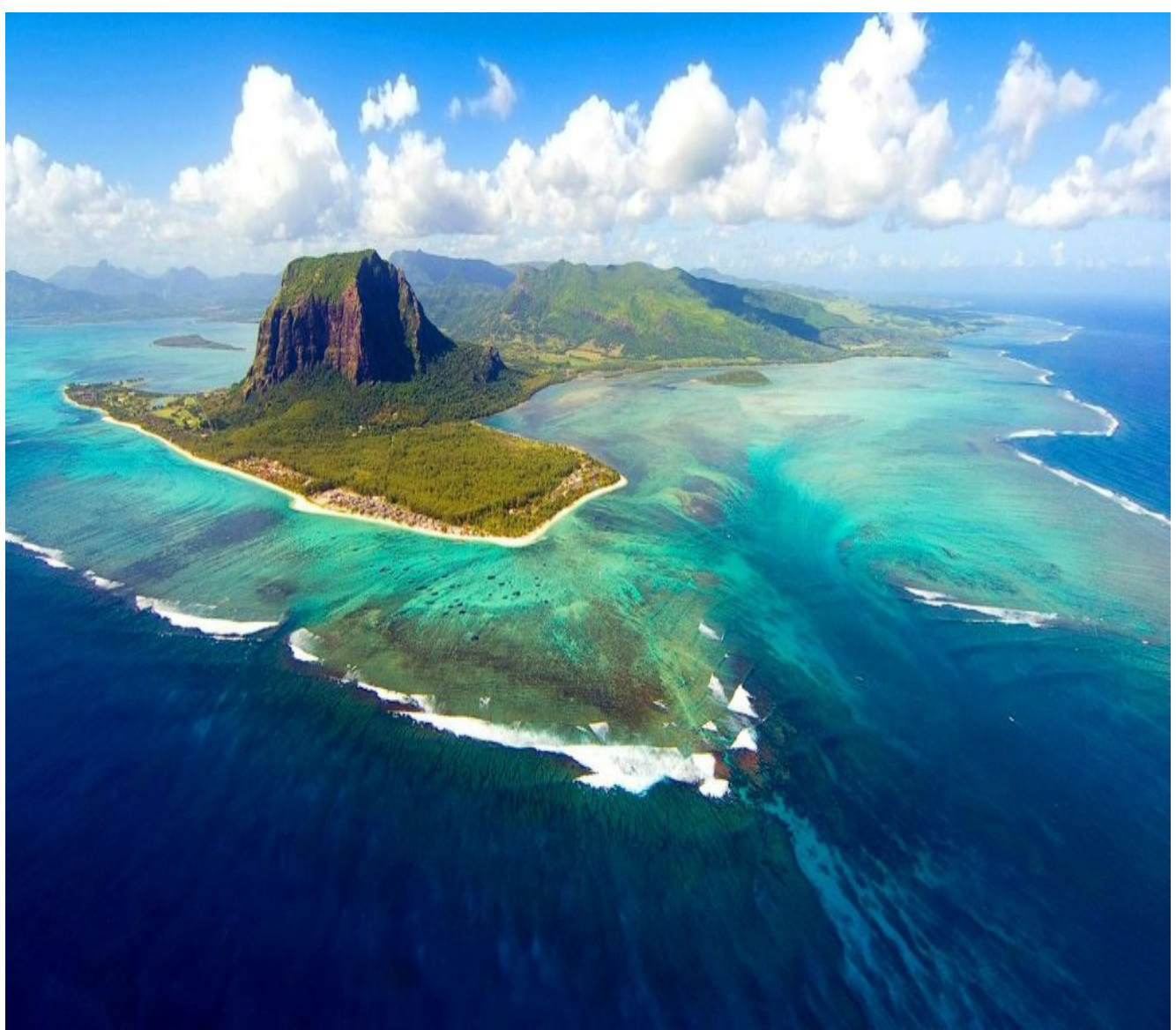
Underwater waterfall in Mauritius: Just off the coast of Le Morne mountain lies what appears to be a vast subaquatic cascade. It is in fact a trick of the eye, caused by the formation of sand and silt on the ocean floor.

Ascend to new heights and soak up Mauritius's vibrant hues through captivating helicopter tours. One of the most remarkable highlights of aerial adventures is witnessing the mesmerising optical illusion of the Underwater Waterfall. From the sky, off the shores of Le Morne Brabant on the southwest coast, observe a gradual slope revealing a plunging abyss. Here, sand and silt carried by powerful ocean currents create the illusion of a cascading waterfall, an extraordinary sight that defies imagination. It is an experience that encapsulates the essence of Mauritius's natural wonders, leaving an indelible mark on all who behold it.