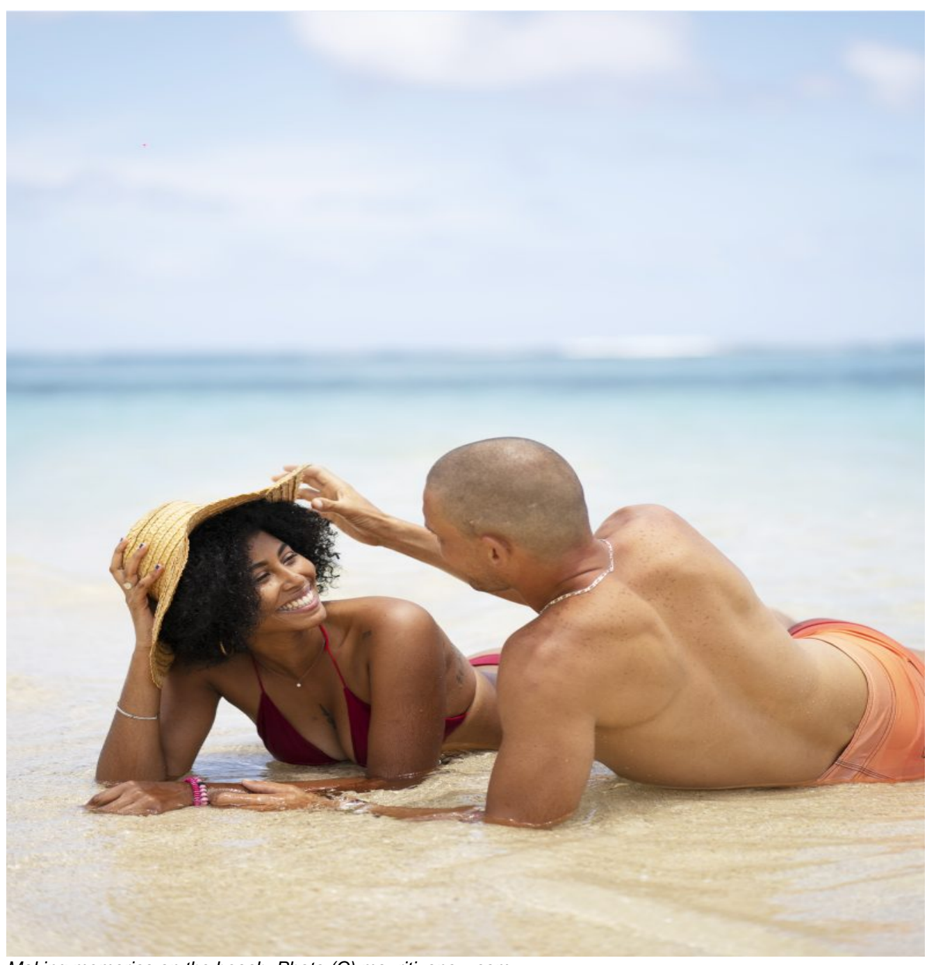
Making memories on the beach.

It's no secret that Mauritius is a honeymooner's paradise and the experience would be incomplete without a romantic spa retreat with your partner in an open-air cabana. In this part of the world, nature reigns supreme, extending far beyond its picturesque coastlines. From lush mountain forests to exotic wildlife, the island abounds with natural wonders. Even in spa treatments, nature plays a vital role, with locally sourced oils and plants imparting a deep connection to the surroundings. Elevating the experience, many luxury hotels offer outdoor cabanas, where you can relax to the gentle rhythm of ocean waves and swaying palms while enjoying an intimate couples' massage by the sea.