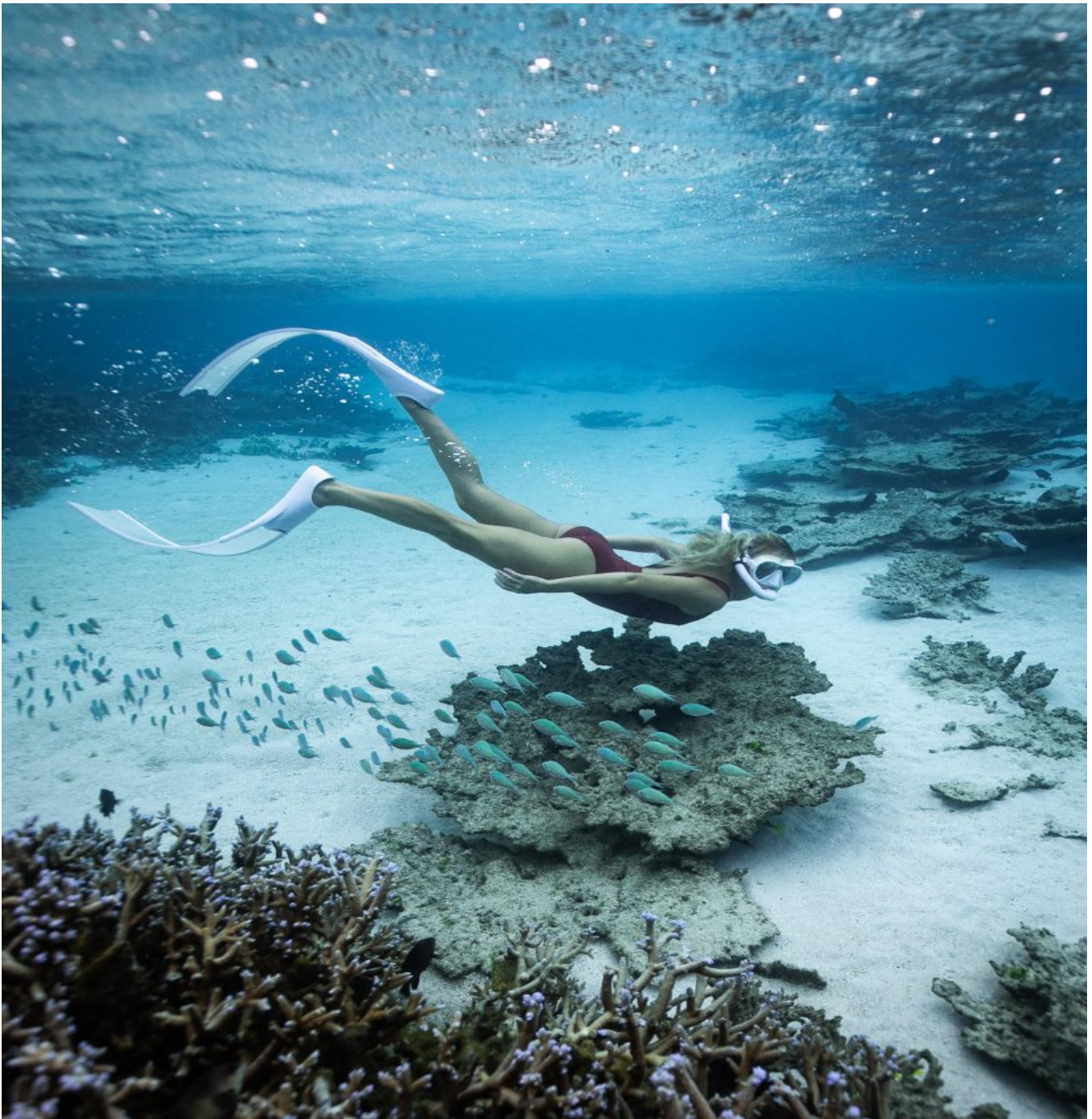
Snorkeling in Mauritius.

Tucked away as one of Mauritius' most secluded regions, Rodrigues exudes a distinct aura, seemingly existing in a realm apart from the mainland. The island is located around 580 kilometres northeast of Mauritius and takes about an hour and a half to fly to the island from Mauritius. Spend your days embarking on boat excursions to nearby islands, encountering majestic tortoises, exploring the vibrant Saturday market at Port Mathurin, or indulging in diving and snorkeling adventures along the southern coast or around La Passe St François.