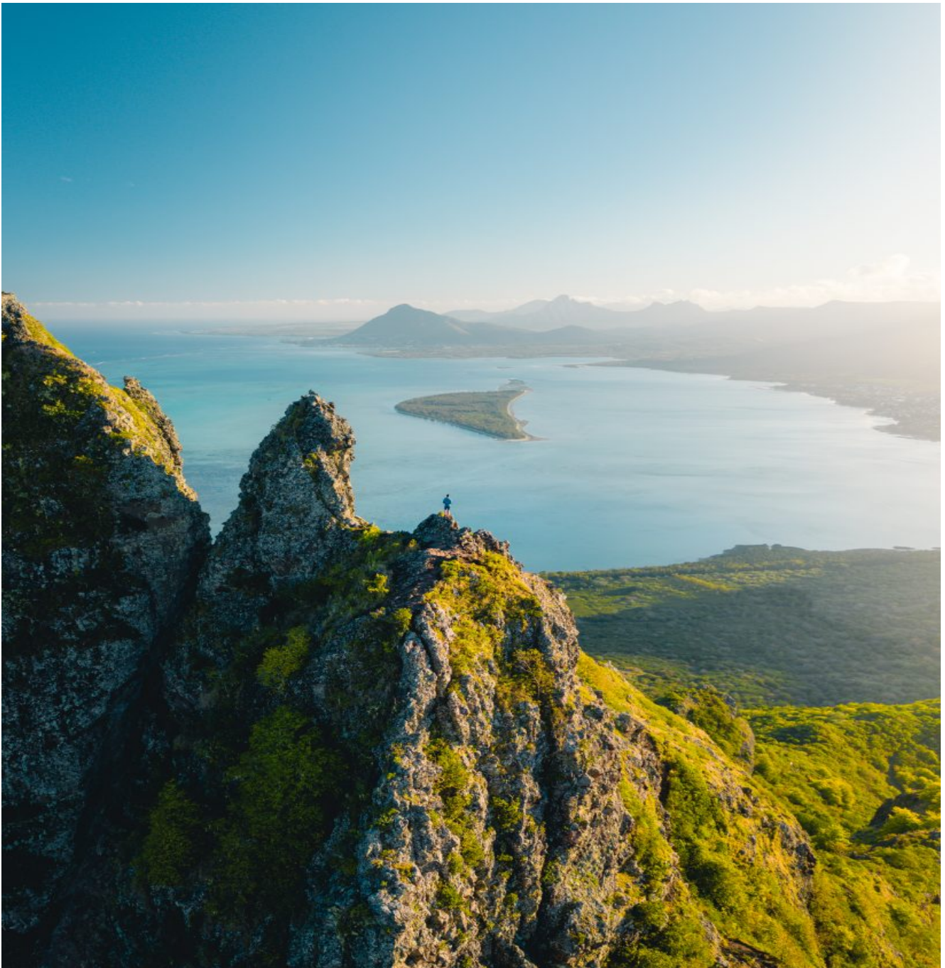
Hiking in Mauritius.

Nestled in the verdant heart of Mauritius lies the pristine Black River Gorges National Park, a mere stone's throw from the coastline. This protected wilderness is a haven for indigenous flora and fauna, housing a rich tapestry of biodiversity , including rare species like the Mauritius kestrel, echo parakeet, and pink pigeon. Embark on a hike through lush forests adorned with cascading waterfalls , keeping a keen eye out for white-tailed tropicbirds soaring overhead and pink pigeons gracefully traversing the trails. Mauritian flying foxes, wild boars, macaque monkeys, and deer also inhabit the island.