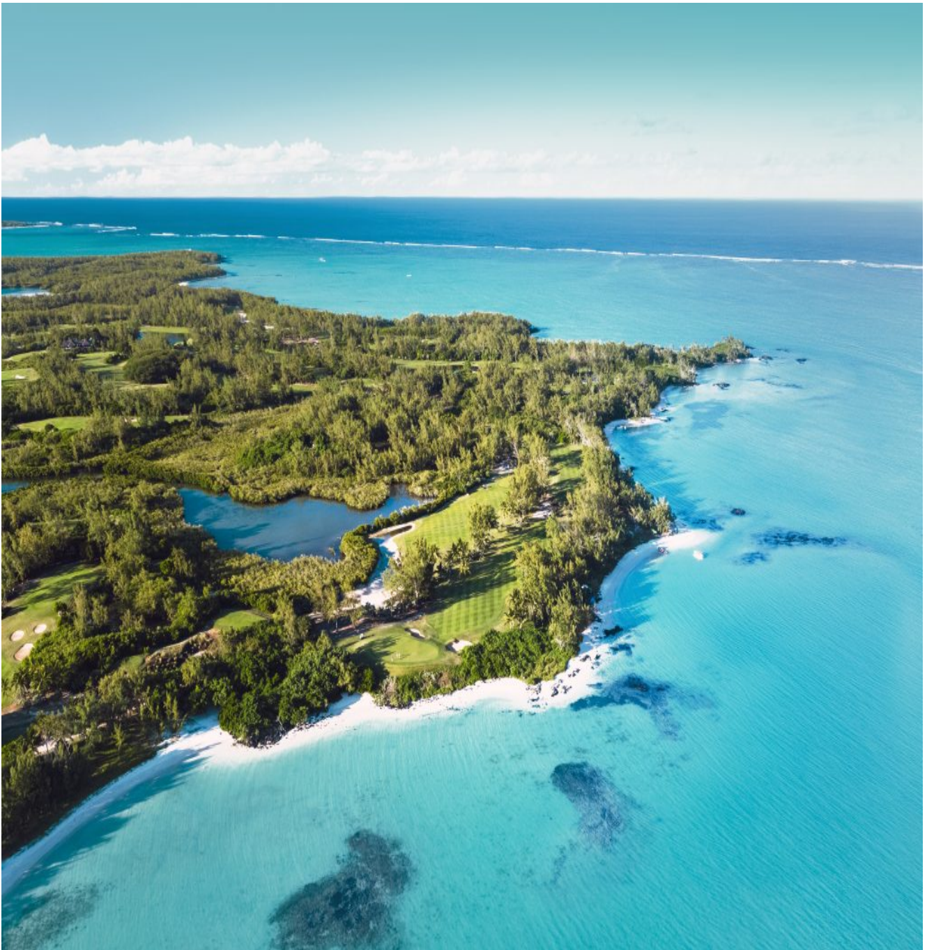
Île aux Cerfs island.

East Mauritius beckons with some of the island's most stunning beaches, a vast lagoon with crystal-clear waters, and refreshing breezes year-round. Belle Mare beach boasts one of the longest stretches of sand, ideal for leisurely strolls under the shade of casuarina trees. Explore pristine shores along the east coast and embark on boat or catamaran excursions to idyllic islands like Île aux Cerfs , perfect for beach outings or a round of golf. Don't miss a visit to Trou d'Eau Douce , a charming fishing village steeped in history, where you can witness breathtaking sunrises and observe local fishermen heading out to sea. Explore the coastal scenery by bicycle, discover Roches Noires and its waterfront, or immerse yourself in the vibrant atmosphere of the Central Flacq market . For adventure seekers, climb Lion Mountain for panoramic views, cool off in waterfall pools, or delve into the wilderness of La Vallée de Ferney wildlife reserve on quad bike or foot. And don't forget to explore Bras D'Eau National Park , home to majestic ebony trees and rare bird species, perfect for a scenic walk.