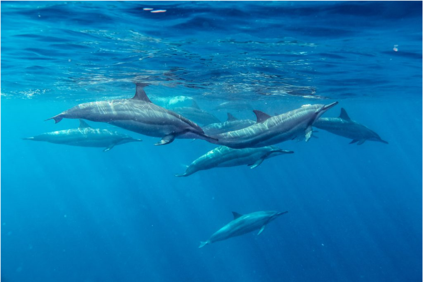
Dolphin Spotting in Mauritius.