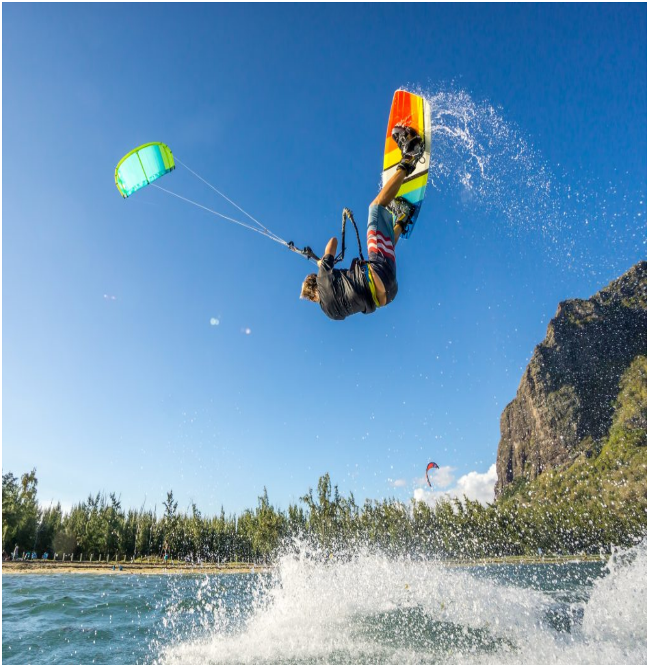
Kitesurfing in Mauritius.