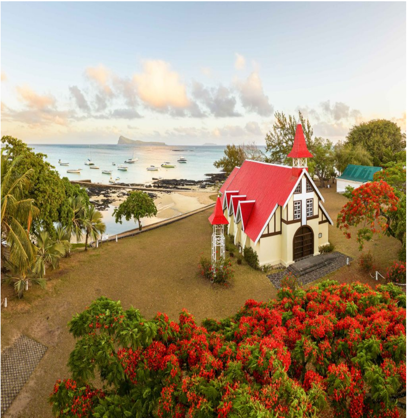
Cap Malheureux Church in North Mauritius.

The north of Mauritius is renowned for its lively atmosphere and bustling nightlife, making it the perfect destination for those seeking excitement and adventure. As the sun sets, Grand Baie's bars and restaurants come alive with DJ sessions, live music, and vibrant nightclubs. Indulge in fine dining , sip cocktails at chic beachfront bars , or unwind at laid-back eateries overlooking the sea. Shopping enthusiasts will delight in the plethora of boutiques, malls, and markets offering unique souvenirs. The north is also a haven for outdoor enthusiasts, with golf courses , kitesurfing spots, and pristine sandy beaches awaiting exploration. Embark on boat trips to discover enchanting northern islands like Ilot Gabriel and Coin de Mire , renowned for their stunning scenery and superb snorkeling opportunities or immerse yourself in the rich culture and history of the region by visiting landmarks such as Château de Labourdonnais and the iconic red-roofed church at Cap Malheureux .