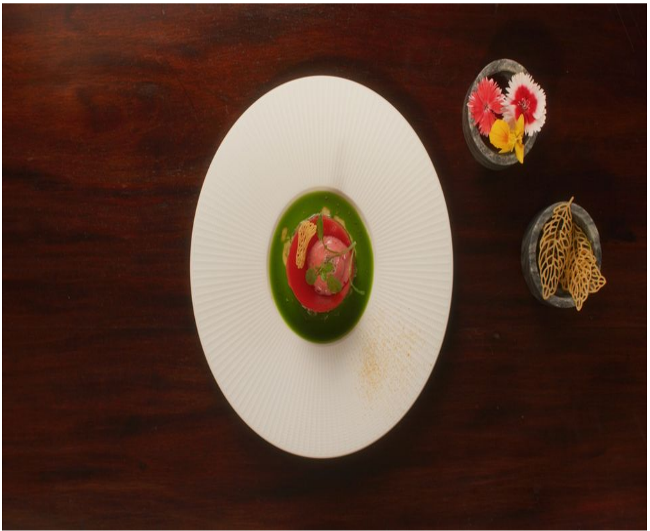
Fine Dining in Mauritius.

Global culinary influences and celebrity resort chefs are one thing, but there's no finer dining experience in Mauritius than grabbing a table at a beachfront shack, and ordering the freshest Indian Ocean seafood imaginable. Take your pick from lobster, prawns, octopus, grilled fish, calamari and more, and decide whether you want it served grilled or smothered in a red Creole sauce, then sit back and enjoy your seafood feast with a view.