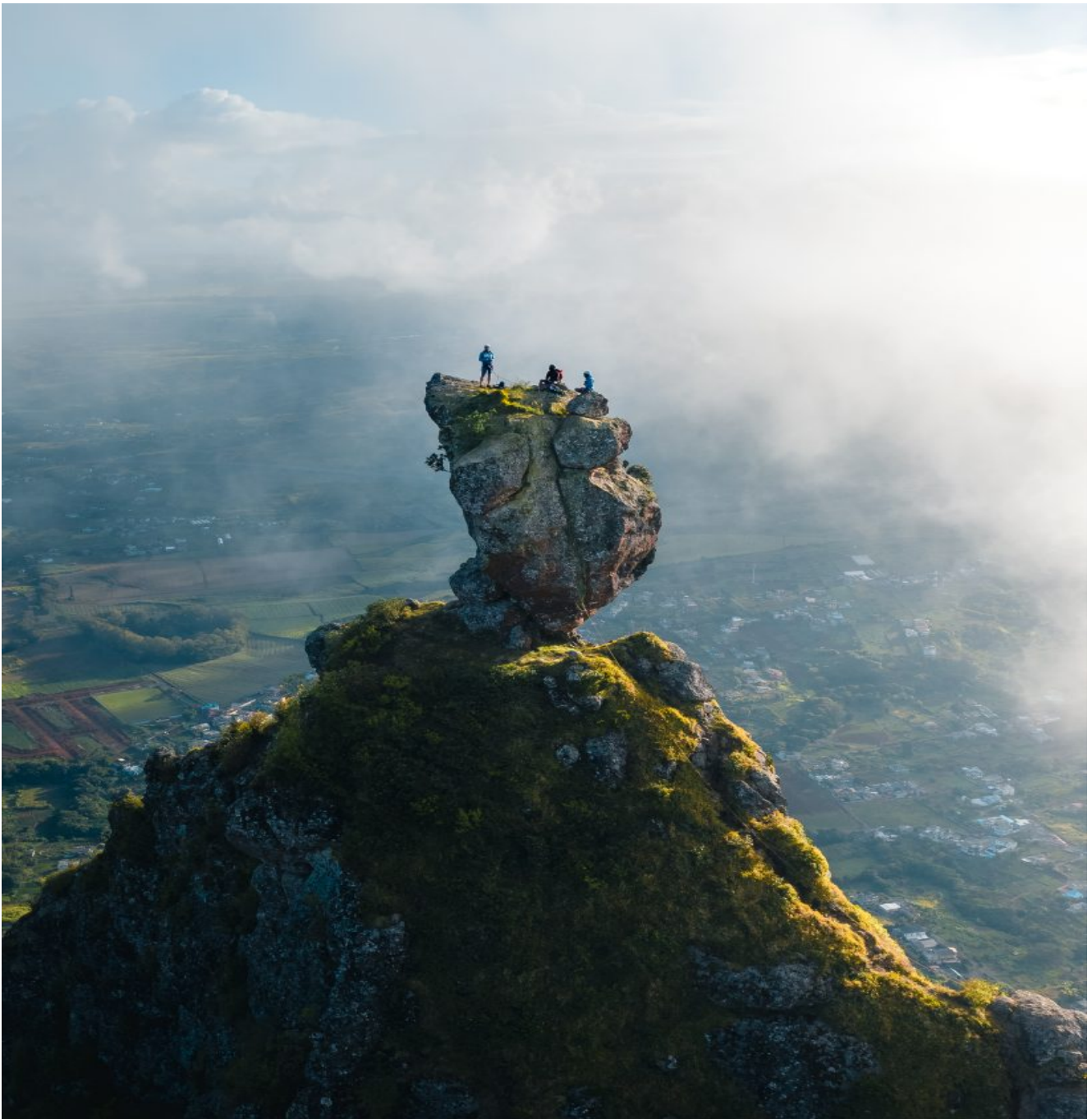
Hiking Pieter Both Mountain.

While most visitors head for the coastal resorts, Central Mauritius has some hidden gems including mountains, historic mansions, and vibrant shopping malls. Embark on a hike to Le Pouce Mountain , following in the footsteps of Charles Darwin , or explore Pieter Both mountain with a knowledgeable guide. Delve into the island's rich history by dining in a colonial house at Le Domaine des Aubineaux in Curepipe , or wander through the historic Eureka House in Moka , now transformed into a captivating museum surrounded by lush gardens and cascading waterfalls. Shopaholics will delight in the modern shopping malls like Les Arcade Currimjee and Bagatelle Mall , while Quatres-Bornes boasts La City Trianon and Phoenix Mall , easily accessible via the Metro Express. Don't miss the chance to tee off at the historic Gymkhana Club Golf Course , dating back to 1844, offering 18 holes and a unique night driving range experience.