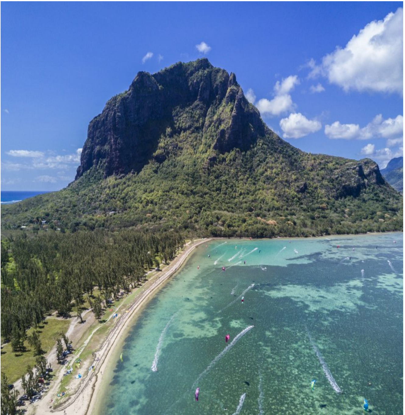
Sailing in Mauritius.