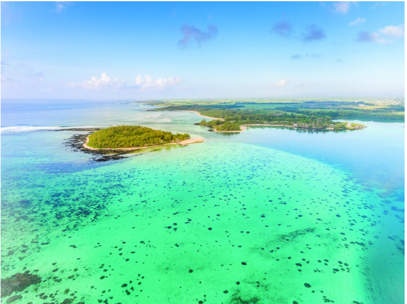
Blue Bay Marine Park.

The southern coast of Mauritius exudes a rugged charm, boasting authentic fishing villages , expansive beaches , and dramatic volcanic rock cliffs pounded by crashing waves. Escape to this tranquil enclave to immerse yourself in nature's wonders, from the majestic Rochester Falls to the awe-inspiring Le Souffleur water spring , reminiscent of a geyser shooting into the sky. Embark on the Tea Trail to delve into the island's rich tea heritage, meandering through three plantations and admiring grand colonial mansions. Indulge your senses with the island's favorite vanilla tea along the way. Discover hidden gems like Pomponette and Riambel beaches along secluded paths, and pay homage to Hindu traditions at the sacred Ganga Talao, home to the towering 33-meter statue of Shiva. For an enriching nature experience, embark on a guided hike through the pristine Ile aux Aigrettes nature reserve, where you can encounter rare wildlife such as the pink pigeon and Mauritius fody. Cool off in the crystal-clear waters of Blue Bay Marine Park , renowned as one of the island's premier snorkeling destinations.