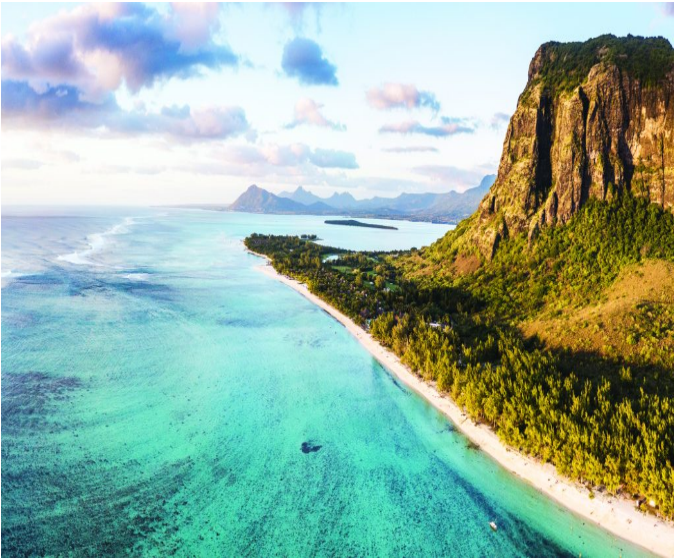
Le Morne Beach.

The western coast of Mauritius boasts enchanting sunsets, breathtaking nature, and pristine beaches, all amidst a relaxed pace of life. Discover perfect beaches and exceptional diving and snorkeling spots like Crystal Rock . Kitesurfing enthusiasts should head to Le Morne on the southwest coast, renowned for its strong tradewinds and famous spots like One Eye , with numerous schools available for instruction. The iconic Le Morne Brabant mountain , a UNESCO World Heritage Site, dominates the west coast skyline, offering a rich history to explore during your stay. For adventurers, Black River Gorges National Park is a hiker's paradise, featuring 50 km of marked trails and scenic waterfalls. Look out for the famous Chamarel Waterfall . Indulge in street food at Tamarin Bay , hike up to Phare d'Albion Lighthouse , or unwind at a beach bar with a DJ spinning tunes against the backdrop of a stunning sunset. For a truly unforgettable experience, book a scenic seaplane ride to witness the mesmerizing 'underwater' waterfall from above.