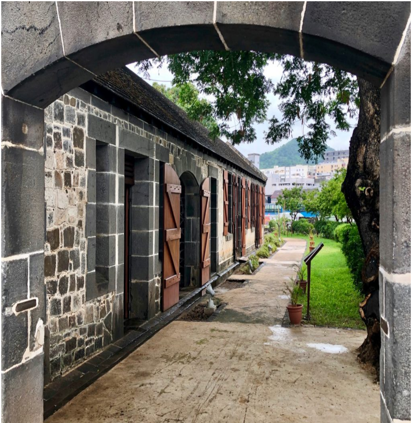
Port Louis.

Discover the Vibrant Heart of Mauritius in Port Louis , the bustling capital nestled in the northwest. Here, amidst towering skyscrapers and lush parks, you'll find a fusion of modernity and tradition. Explore the Central Market , a local treasure trove brimming with tropical fruits, delectable pastries, and the island's famed aloude drink. Wander through Chinatown's labyrinthine streets, where aromatic delicacies beckon from every corner and vibrant street art adorns the walls. Begin your exploration at the Caudan Waterfront , a vibrant hub boasting shopping malls, cultural centers, and waterfront promenades adorned with colorful umbrellas. Immerse yourself in the island's rich history at Aapravasi Ghat , a UNESCO World Heritage Site that bears witness to Mauritius' multicultural heritage. Marvel at the architectural diversity of Port Louis, from the Sockalingum Meenatchee Ammen Kovil temple and the Jumrah Masjid mosque to the St Louis Cathedral and the Kwan Tee Pagoda, each a testament to the city's cosmopolitan soul.