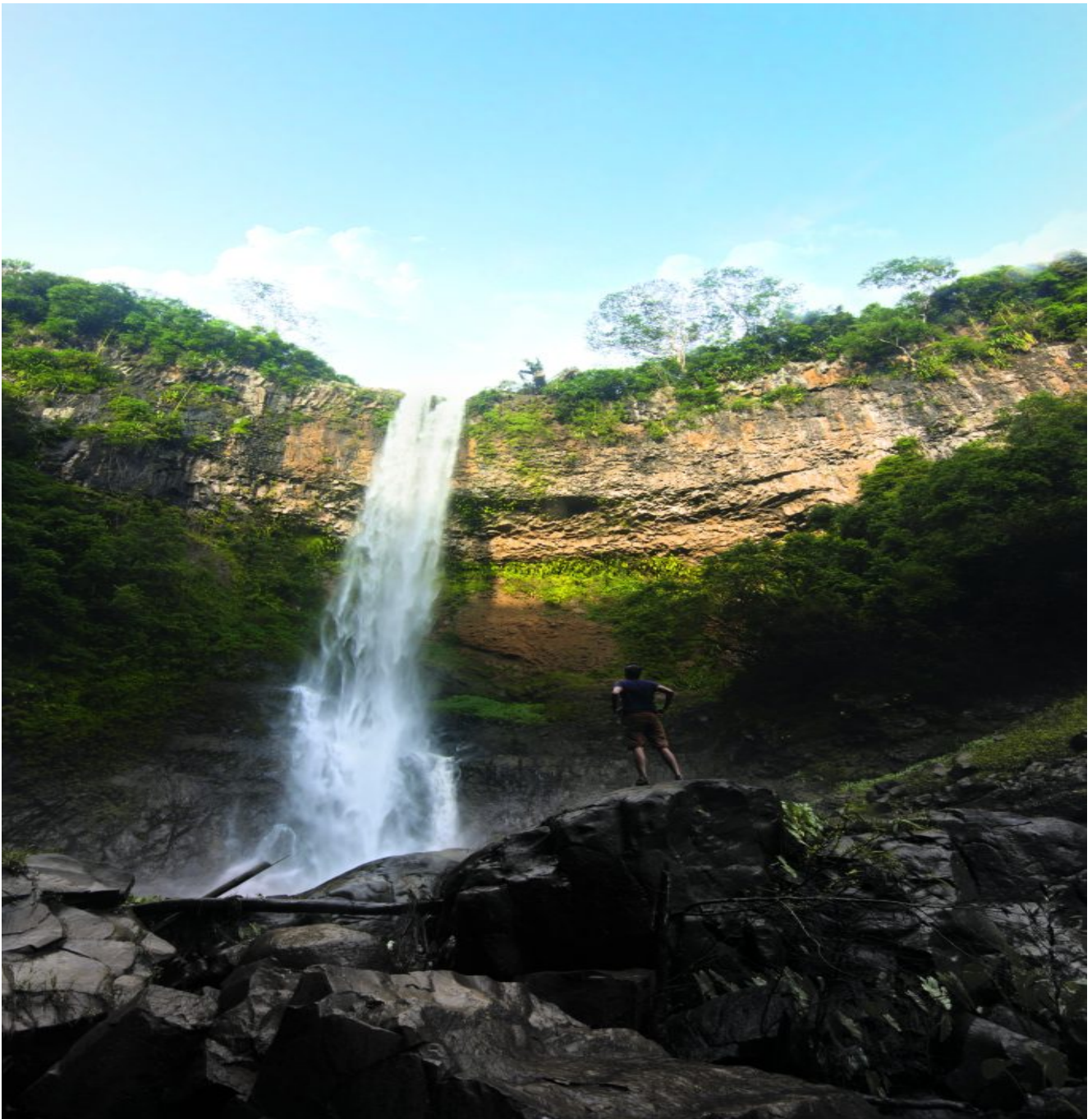
Chamarel Waterfall.

Escape the coast and venture to Chamarel , a hidden paradise nestled in the hills of Mauritius'. Enjoy panoramic views of the coastline and indulge in the burgeoning culinary scene with quaint eateries and upscale restaurants. Explore the 7 Coloured Earth Geopark , where colourful sand dunes reveal 600 million years of geological history. Don't miss the majestic Chamarel Waterfall , standing at 100 meters tall, fed by the Saint-Denis River. Catch a glimpse of this natural wonder along the Geopark's access road or embark on a scenic trail to witness its elegant cascade firsthand.